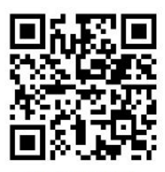
(Apple App Store)

Each entered vehicle that is permitted to do recce will be allocated a code for the application. The Application with the applicable code MUST be active at all times you are in the area undertaking recce.